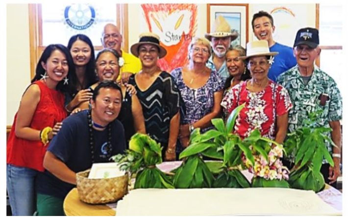
Mahalo Lōkahi Foundation for...The Change Academy