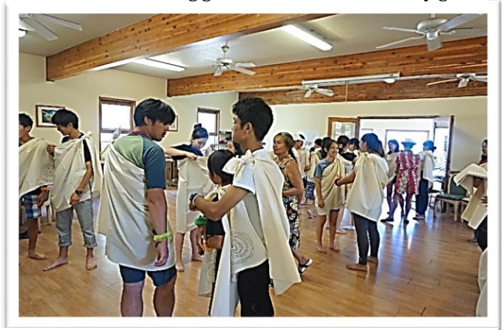
HCCW prepared k\bar{i}hei for the students and chaperones alike for their visit to Kūkaniloko. Here they learned to tie their k\bar{i}hei on each other, then practiced presentation.