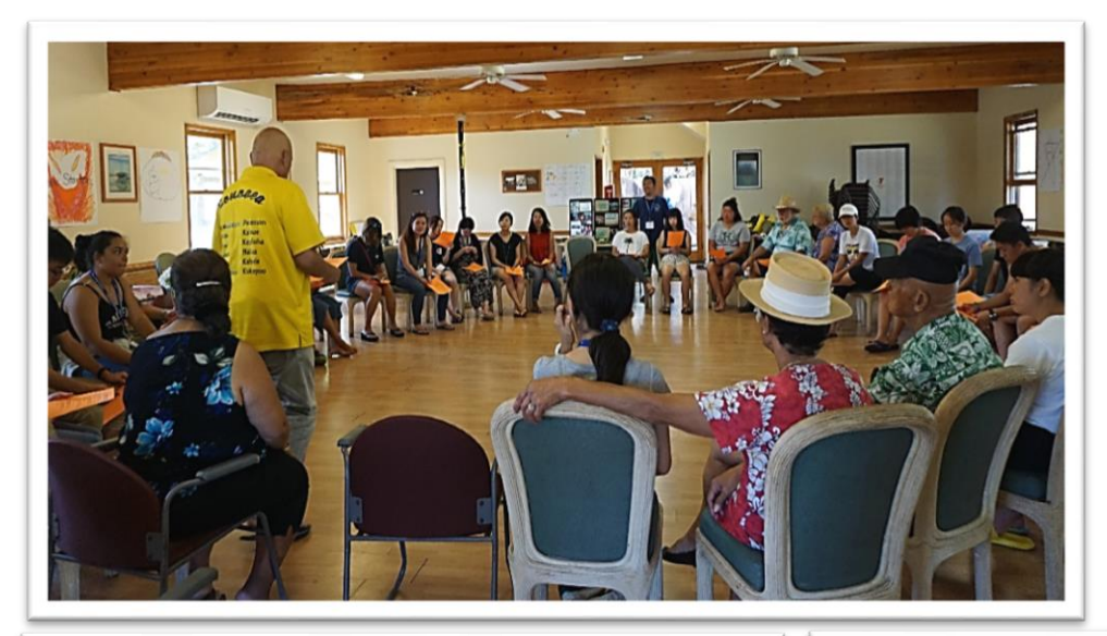
'Õlelo No'eau… Hawaiian Proverb # 2268… Nānā ka maka; ho'olohe ka pepeiao; pa'a ka waha. Observe with the eyes; listen with the ears; close your mouth... Thus one learns.

07.27.2k17...The Change Academy Generation II HCCW Workshop was held at Camp Erdman from 9 am until noon. Eight HCCW kumu met with 12 international and 5 local student participants. A brief introduction was followed by instructions by Kahu Lonoae'a. Kumu taught the entire group of 27 students and chaperones alike, mele kahea for their protocol at Kūkaniloko on the following day. Three leaders were selected and a group response was taught. Their combined efforts were perfect. eo