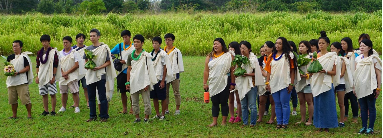
He hā'awi'ana no ka Mele Kāhea a me Nā Mea Ho'okupu 'Elima maiā Ke Kula Ho'ohuli

07.28.2K17...The Change Academy Generation II...Friday, 8 am - 9:30 am Kūkaniloko Protocol