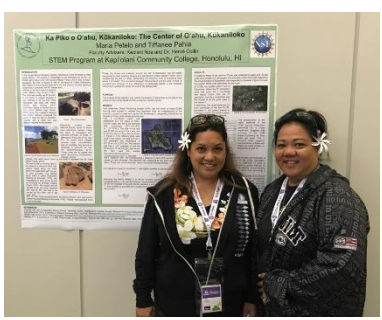
Mahalo Kapiolani Community College for taking piko, Kūkaniloko to WiPCE.